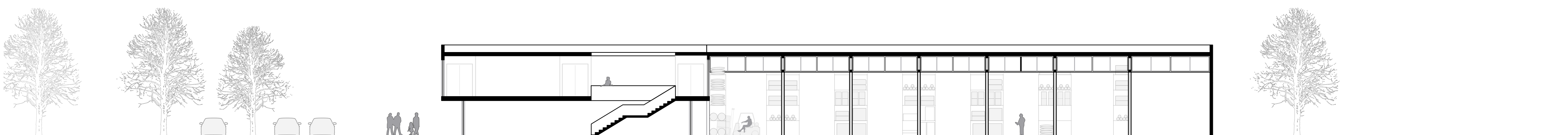
Schnitt A-A | 1:200